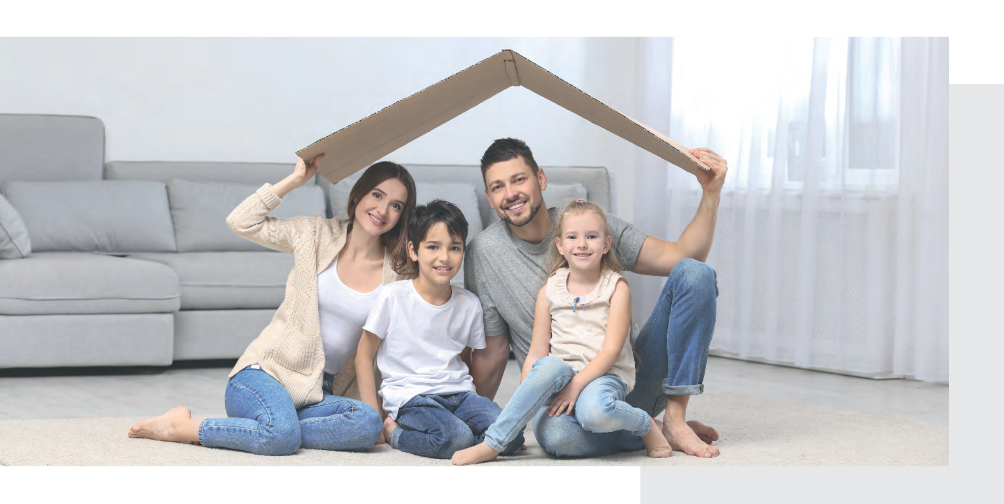
Improve Your Home With Confidence